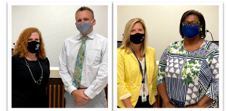
BCPS Employees of the Month

BCPS Employees of the Month for March and April (18:45 - 20:59)