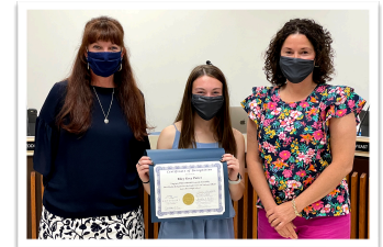
YMCA Model General Assembly

Virginia Western Community College Candidates (8:21 - 17:55)