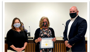
National Geographic Educator Certification