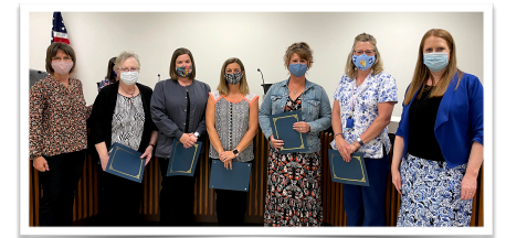
BCPS School Nurses